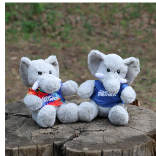
NEW! Camp Tamarack Stuffy- Elephant Mascot