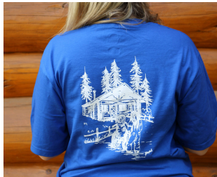
NEW! Blue T-Shirt with Camp Logo