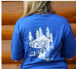
NEW! Blue T-Shirt with Camp Logo