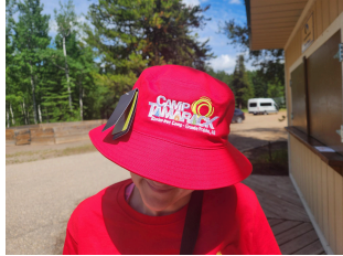
Camp Tamarack Bucket Hat