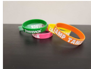
Camp Tamarack Bracelets