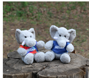
NEW! Camp Tamarack Stuffy- Elephant Mascot