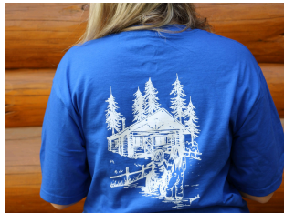
NEW! Blue T-Shirt with Camp Logo