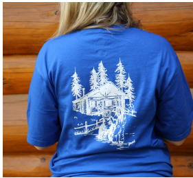
NEW! Blue T-Shirt with Camp Logo